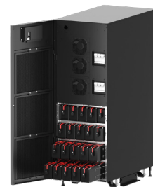
Inbuilt battery models with swappable battery trays design