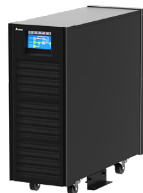
Optional IP42 solution