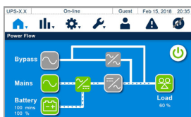
User Friendly 5" Touch Panel

All specifications are subject to change without prior notice.